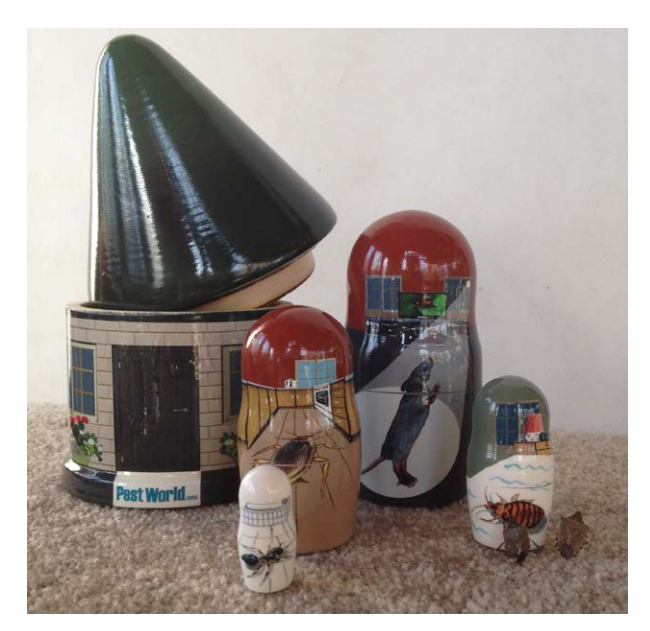
We can't get rid of 'em! Pest World nesting dolls with critters painted on them, our second prize once again. (Actual dead stink bugs added for scale and general yuckiness.)

Advertisement Download Google google.com A free browser that lets you do more of what you like on the web.